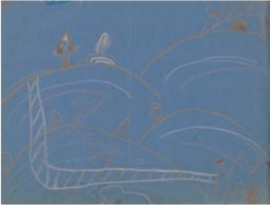
Illustration 1: Princess Leia Travels to a New Home